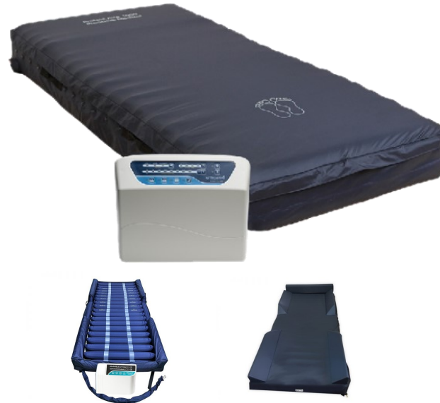
All systems available with foam or air bolsters.

Streamline MedEquip provides a full continuum of proven Alternating Low-Air-Loss mattress systems. All of our support surfaces provide 8" of air support with low shear/friction patient surfaces and simple operation.