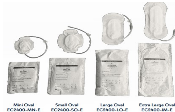
Mini Oval EC2400-MN-E Small Oval EC2400-SO-E Large Oval EC2400-LO-E Extra Large Oval EC2400-IM-E